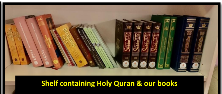
Shelf containing Holy Quran & our books